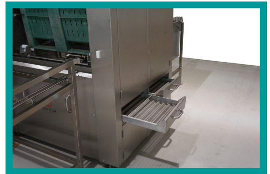
Drawer Filters for Pre-Wash and Main wash tanks